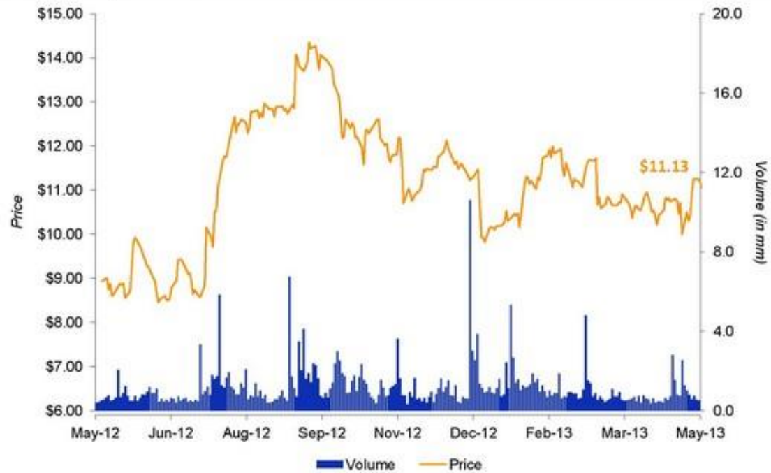
Last 12 month performance